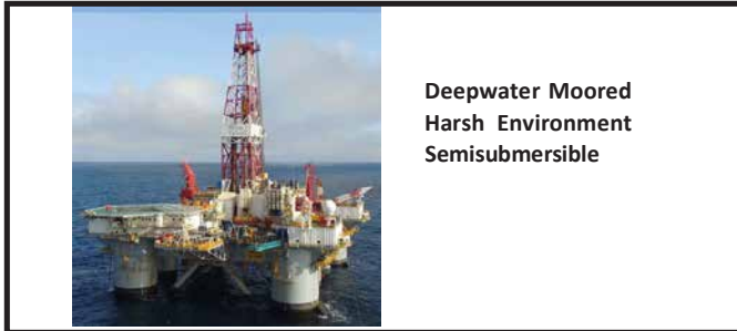
Deepwater Moored Harsh Environment Semisubmersible