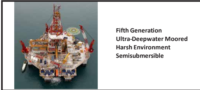
Fifth Generation Ultra-Deepwater Moored Harsh Environment Semisubmersible